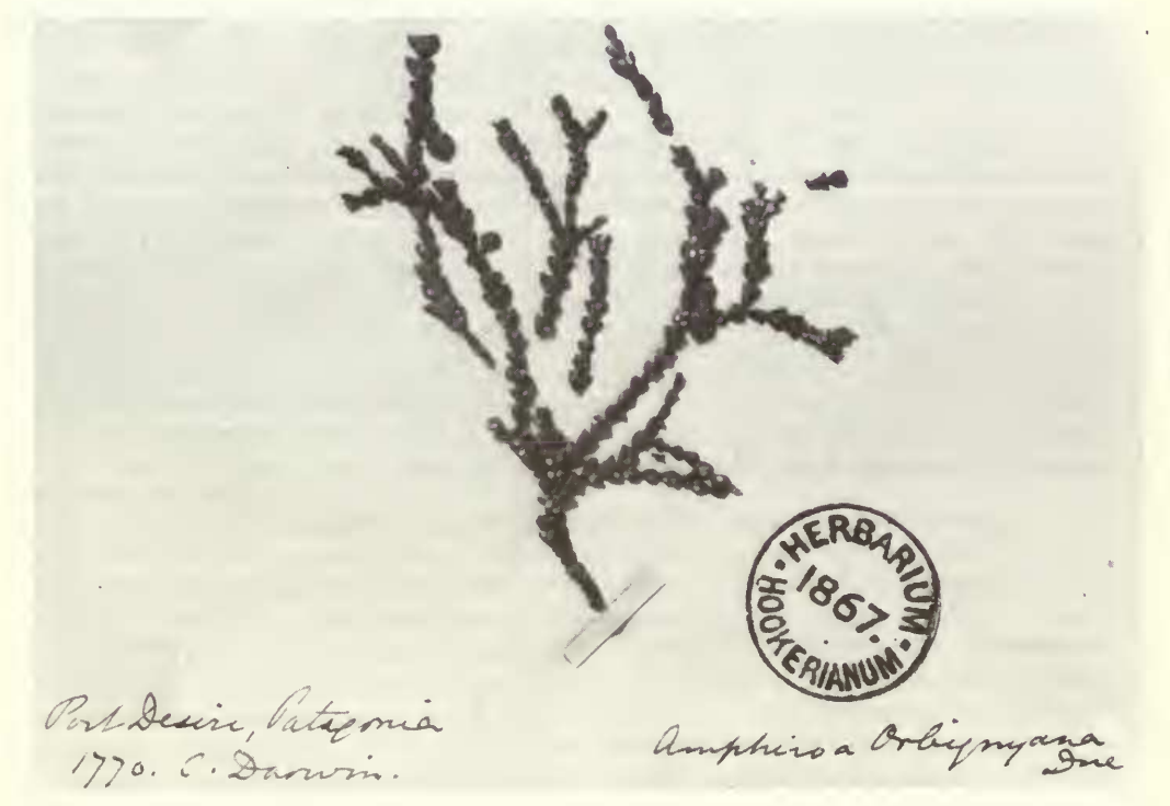
Fig. 4 Darwin 1770, syntype specimen of Amphiroa orbigniana Harvey ex Decaisne from Puerto Deseado, Santa Cruz province, Argentina, collected in January 1834.

At the articulations the stem is contracted. & the external stony case bends in & is not continuous with that of the adjoining limb.—A Section gives the appearance of a cavity; but